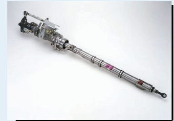
Smiths Dowty CFM56-3 Hydraulic Thrust Reverser Actuator (315A1801)