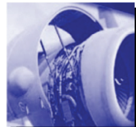
Hydraulic Door Lift Actuators

Prepared to Service the "Next Generation"!