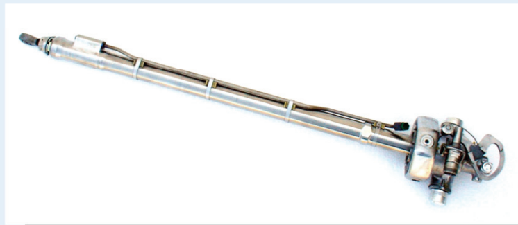
Parker-Hannifin's Thrust Reverser Actuator Assembly for the PW 4164 & PW 4168 (1610000-X)